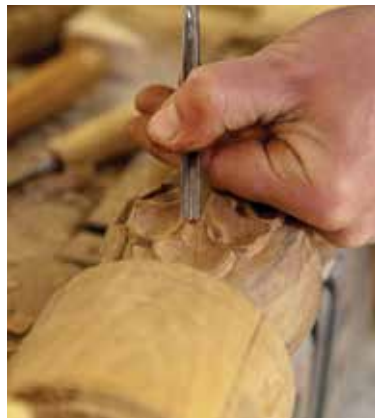
□ Period style furniture