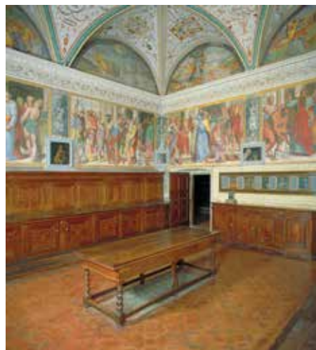
□ Perugia - Collegio del Cambio

Making a leap forward in time, we find contemporary art and its multiform languages expressed in the museums and exhibition areas, even outdoors, that combine art and the environment.