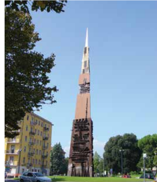
□ Terni - Lancia di Luce di Arnaldo Pomodoro