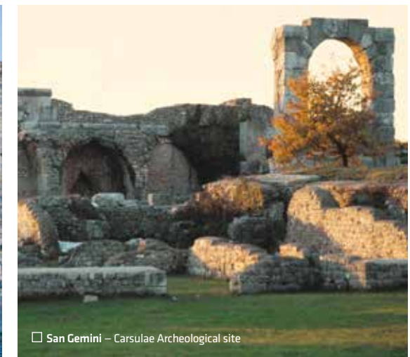
□ San Gemini – Carsulae Archeological site