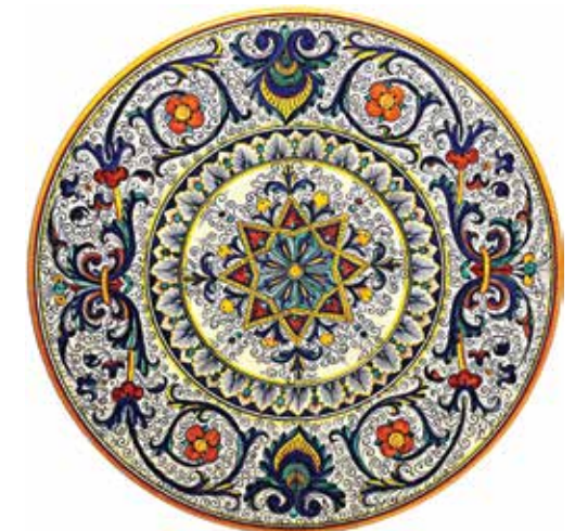
□ Deruta – Ceramics