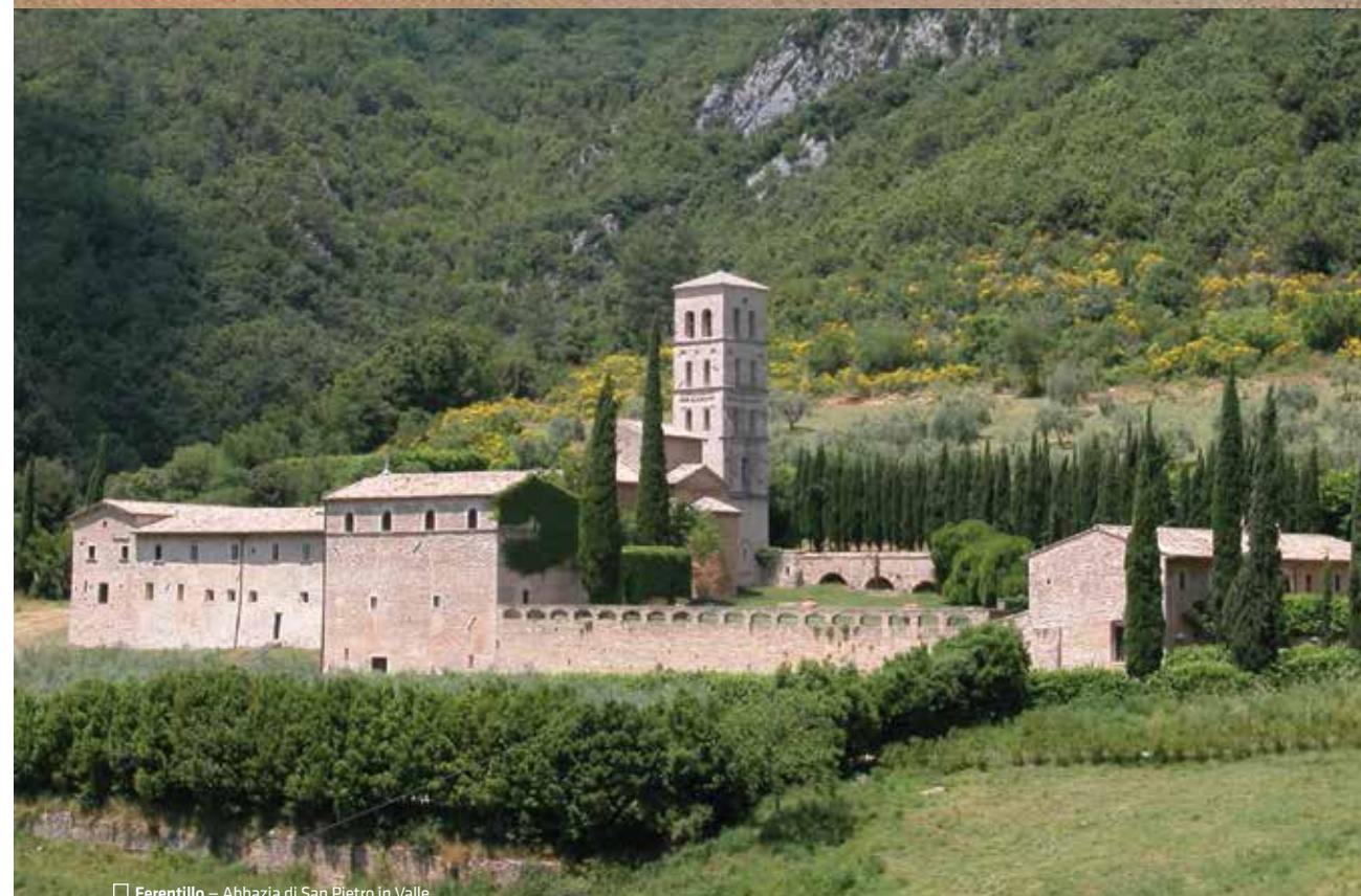
□ Ferentillo – Abbazia di San Pietro in Valle