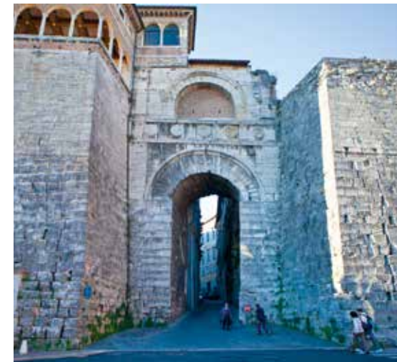
□ Perugia – Etruscan Arch