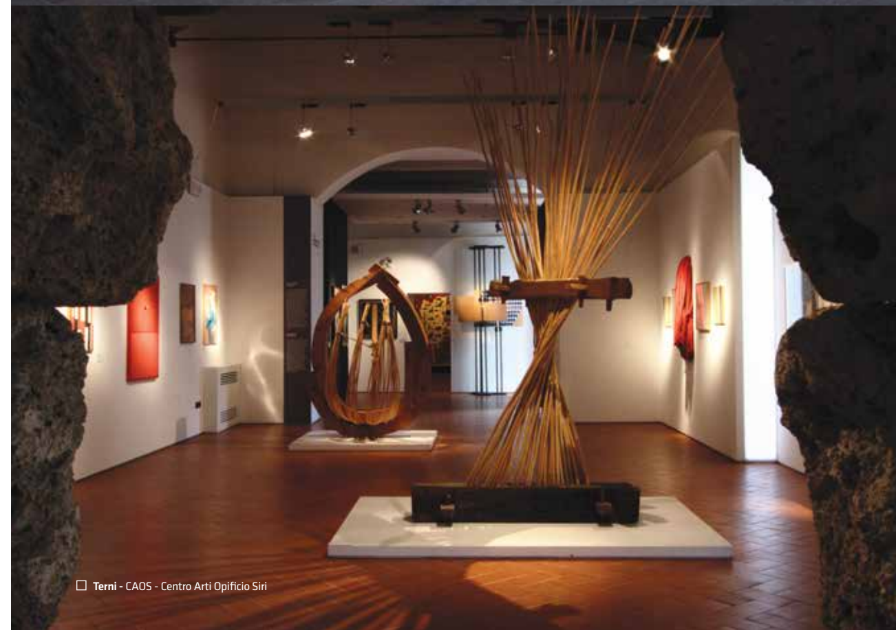
□ Terni - CAOS - Centro Arti Opificio Siri