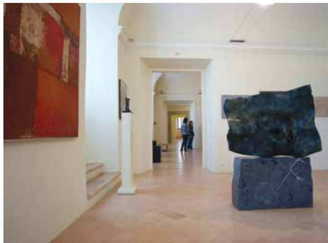
□ Spoleto – Palazzo Collicola Arti Visive – Carandante Visual Arts

Città di Castello celebrates its most illustrious artist, Alberto Burri , one of the greatest figures of the 20th century, with the extensive exhibits of his work, divided between the 15th-century Palazzo Albizzini and the spaces of the Ex Seccatoi del Tabacco Tropicale : probably the only "container" imagined and designed by the same artist. In Città della Pieve , the Giardino dei Lauri : a new space dedicated to contemporary art surrounded by greenery enhances the charm and simplicity of the pre-existing environment through a series of "conceptual art" works.