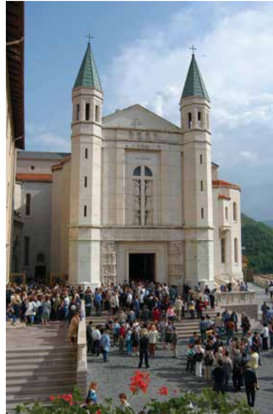
□ Cascia – Sanctuary of Santa Rita