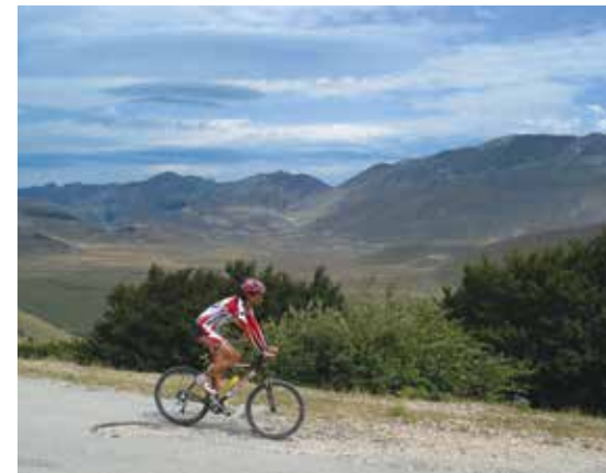
□ Monte Vettore