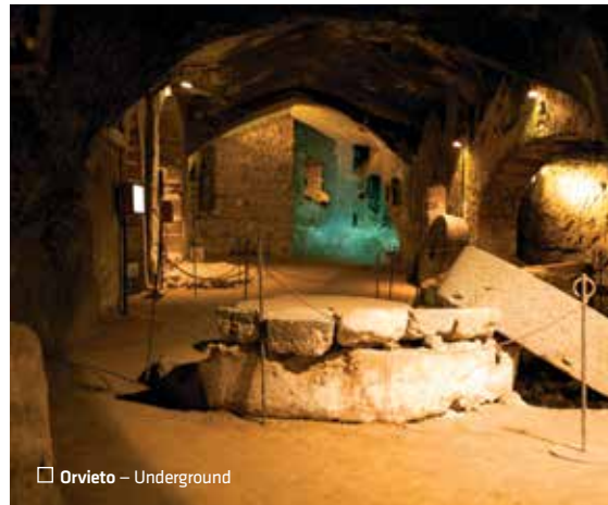
□ Orvieto – Underground