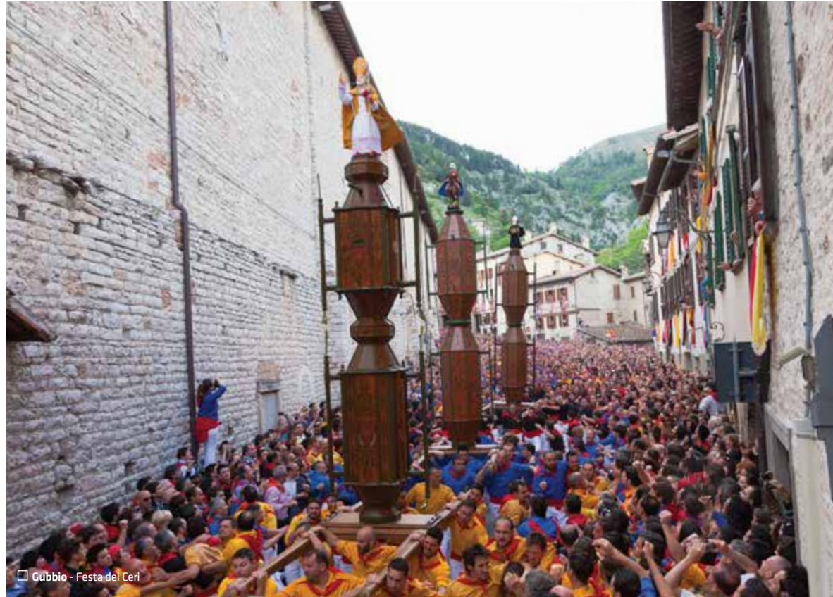
□ Gubbio - Festa del Ceri