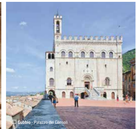
□ Gubbio - Palazzo dei Consoli