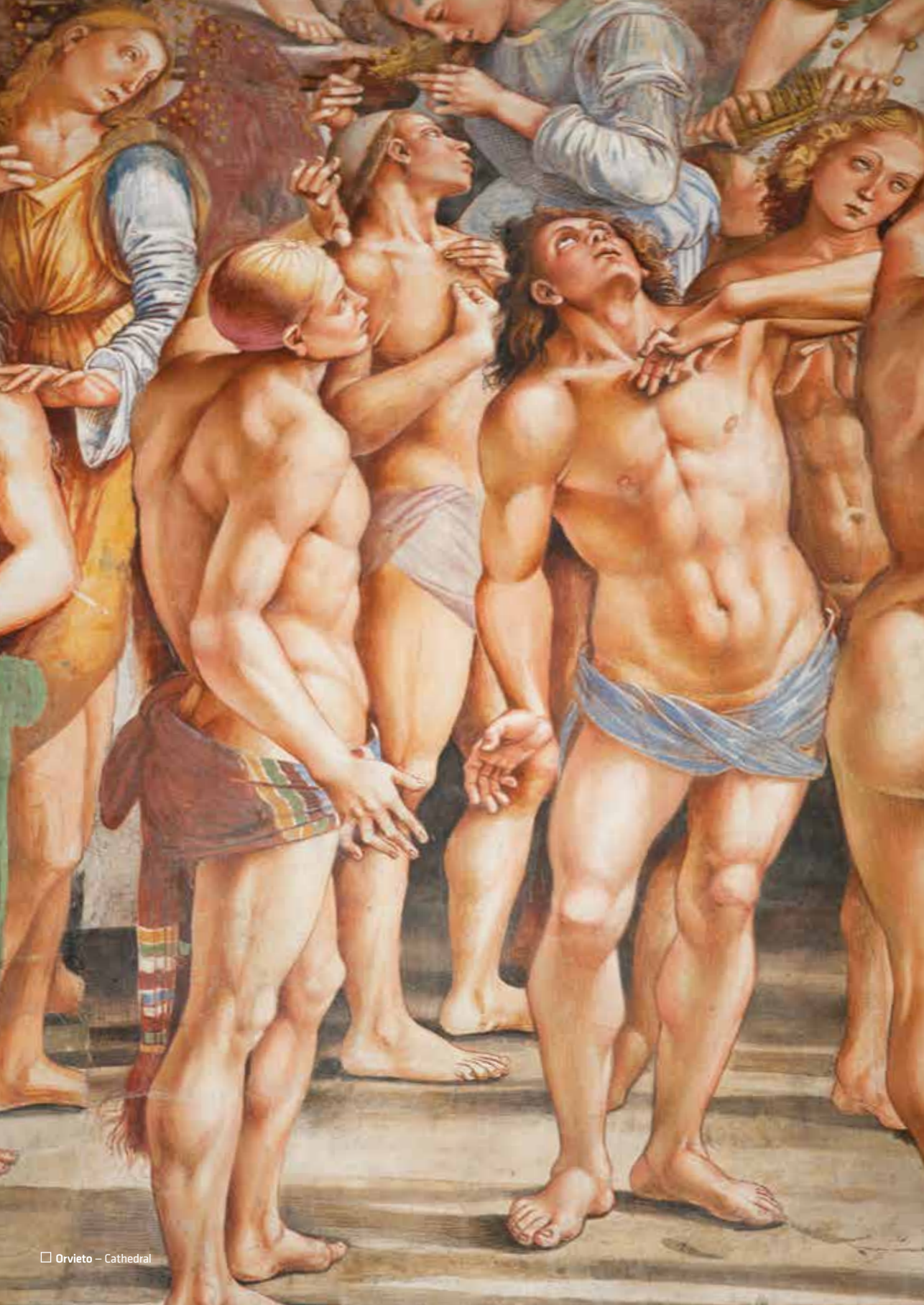
□ Orvieto – Cathedral