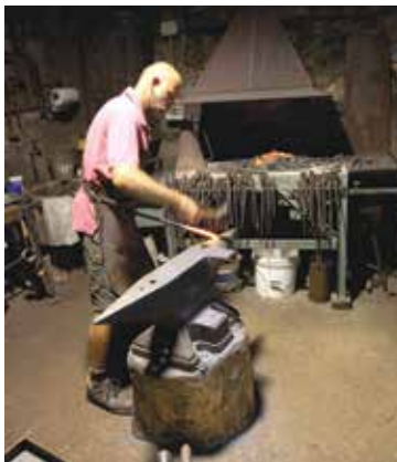
□ Wrought iron