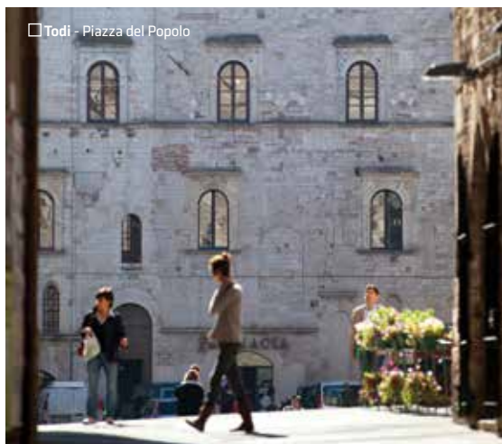
□ Todi - Piazza del Popolo