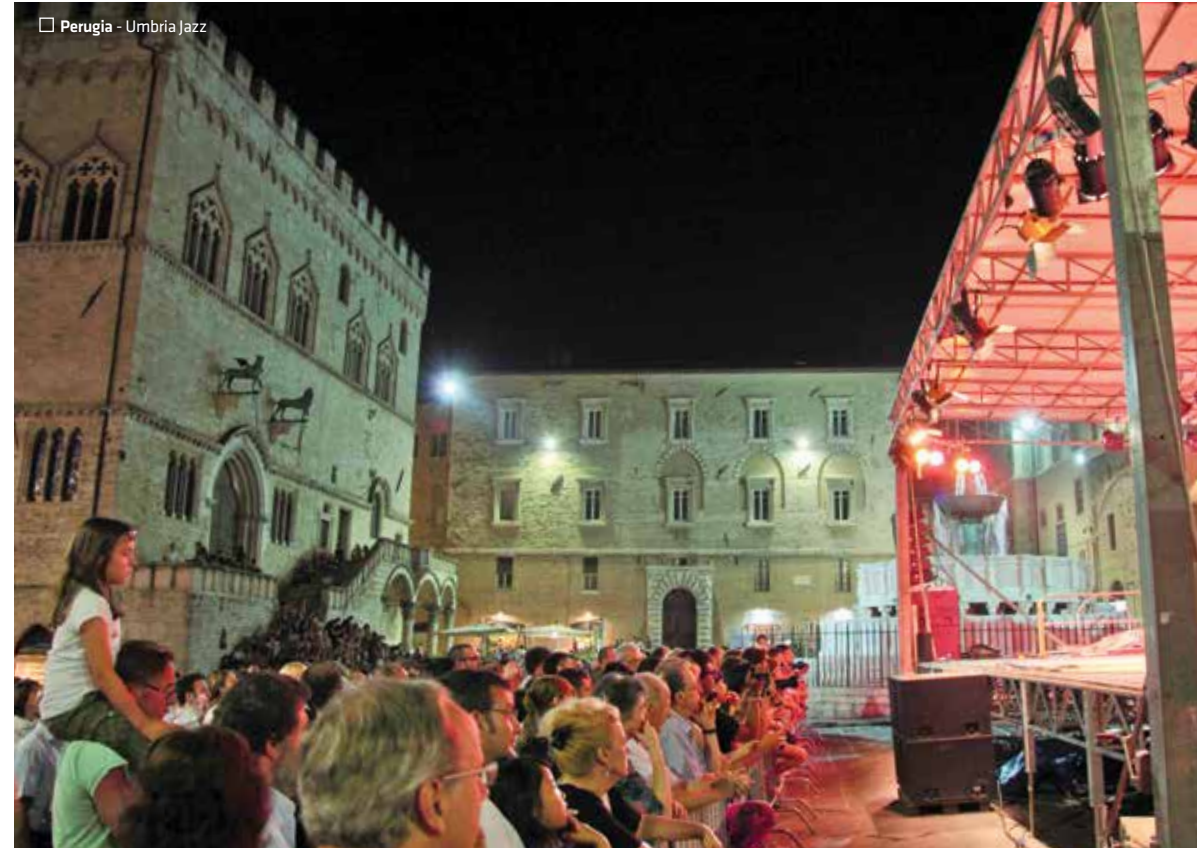
□ Perugia - Umbria Jazz