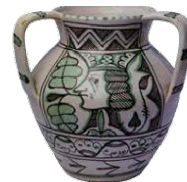
□ Orvieto – Ceramics