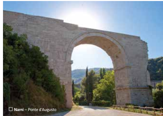
□ Narni – Ponte d'Augusto