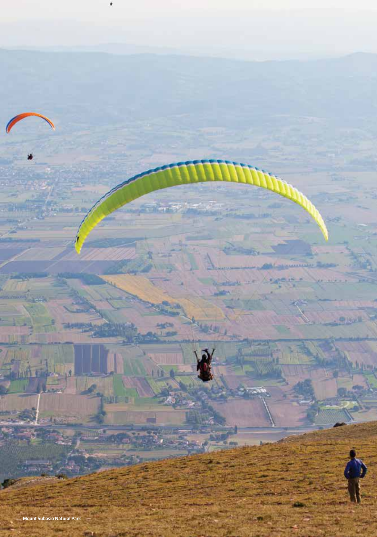
□ Mount Subasio Natural Park