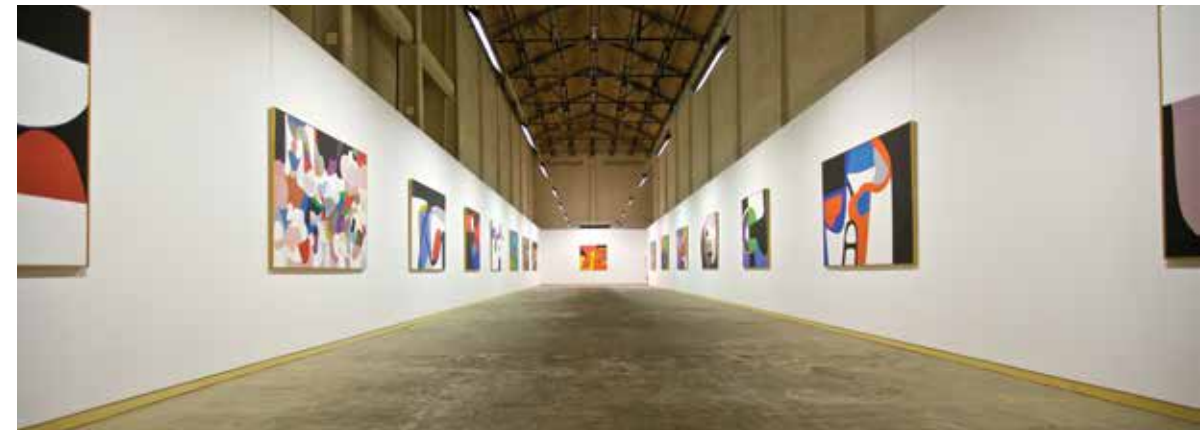
□ Città di Castello – The Burri Collection, Ex tobacco drying rooms

But Umbria never forgets its past characterised by great migratory flows: accomplished with the technique of video projections, the Emigration Museum of Gualdo Tadino displays documents, photos and stories from all over Italy which narrate the migratory exodus that, beginning in the late 1800's, involved more than 27 million departures.