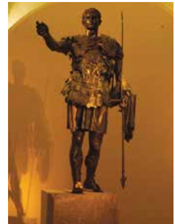
□ Amelia – Archeological Museum, statue of Germanicus

There is, finally, an underground Umbria : just change perspective and get down in the bowels of the Earth to discover other archaeological treasures. Examples include “ Orvieto Underground ”, “ underground Narni ”, “ underground Perugia ”.