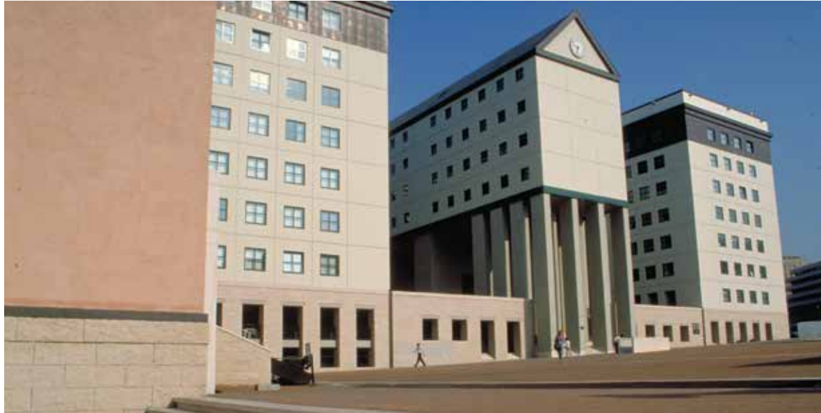
□ Perugia - Piazza del Bacio