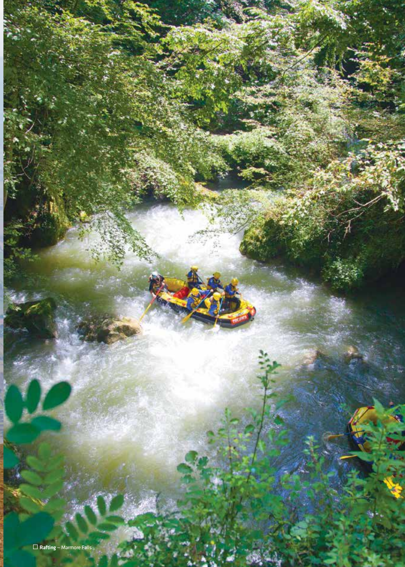
□ Rafting – Marmore Falls