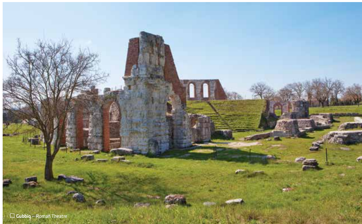
□ Gubbio – Roman Theatre