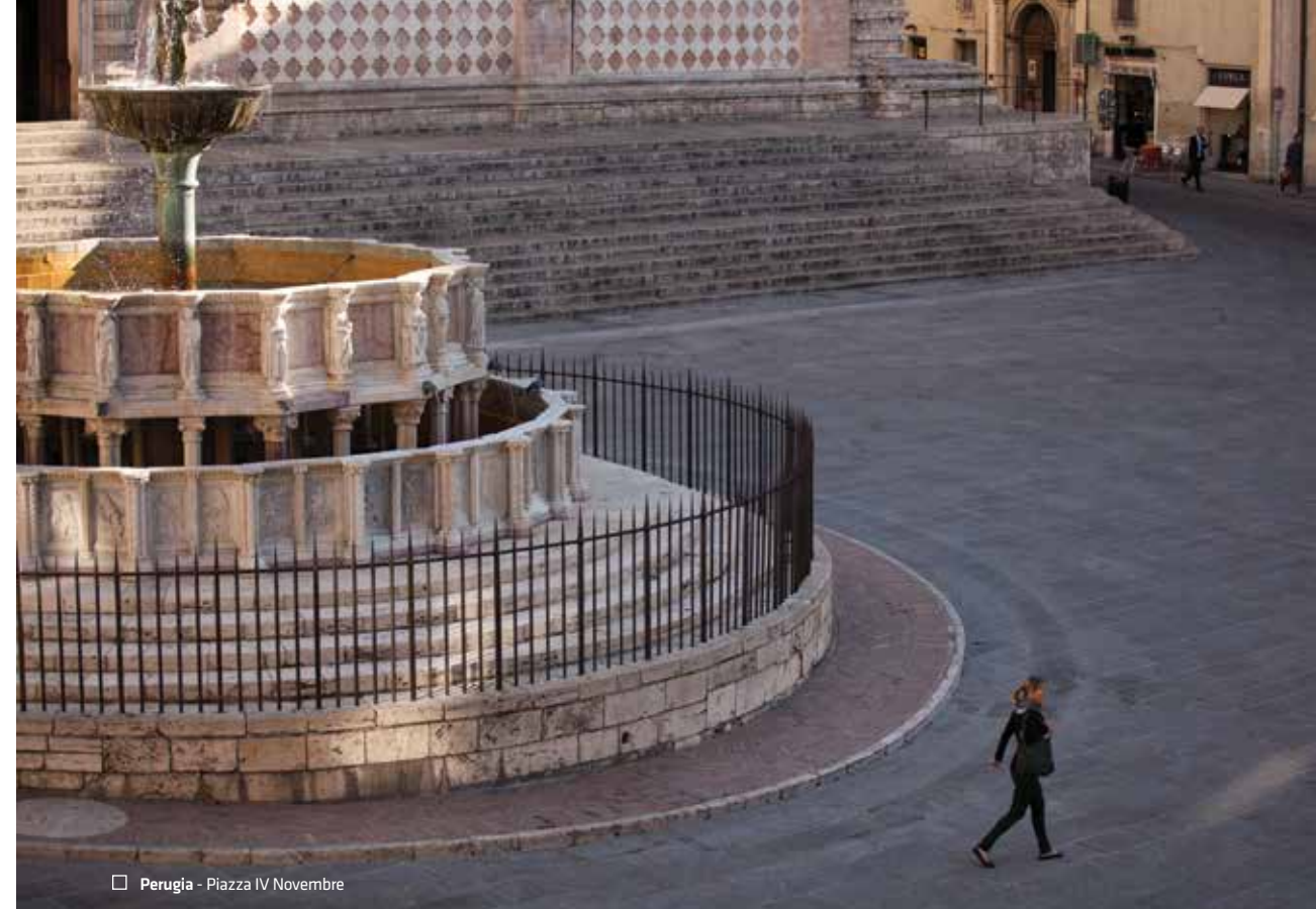
□ Perugia - Piazza IV Novembre