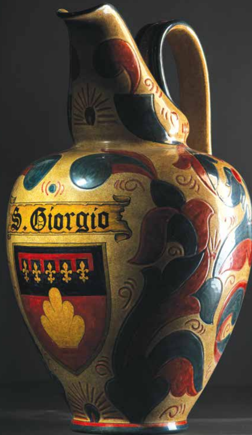
□ Gubbio – Ceramics

In fact, in relation to the tradition and to the artisan workmanship, an industrial activity of the highest quality has developed in Umbria: from aerospace to mechatronics, from innovative energies and green chemistry to industrial design and to the production of cashmere that counts many industry-leading companies in the region characterised by an international appeal. This regional research centre par excellence, an actual district, is one of the greatest symbols of the Made in Italy. From brands known worldwide to small workshops, are more than 500 companies committed to experimenting, weaving and to making cashmere products.